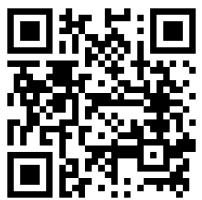
IRB Forms Download

For more information, please contact Email : irb@kmutt.ac.th Tel. : 02-4709623 https://ethics.kmutt.ac.th/ Line ID: @660tgdwz