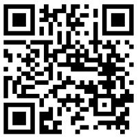
IRB Submission Forms via Email